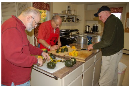
Squash peelers always have fun!