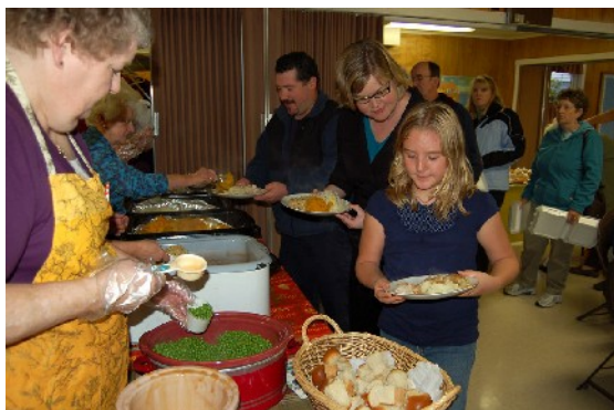
Servers play a major role!