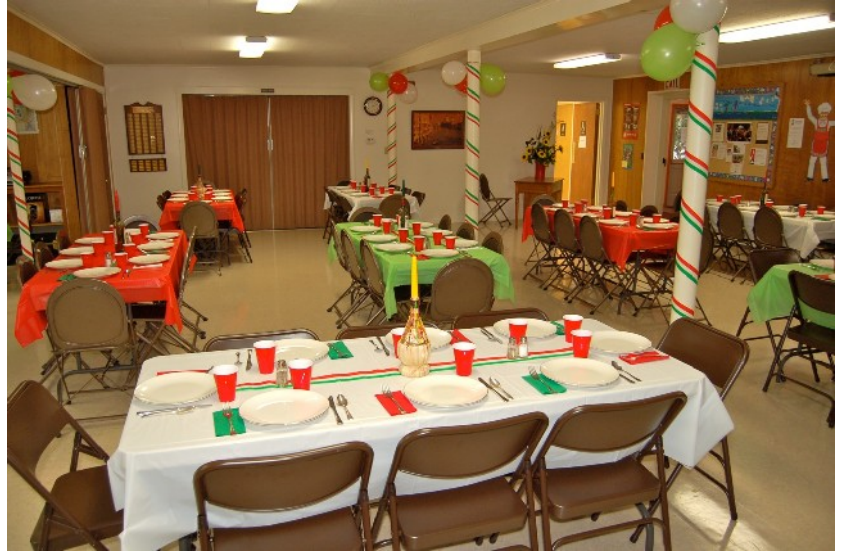
Fellowship Hall looked pretty spiffy!